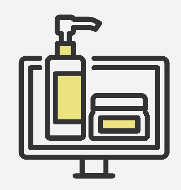
Extending the range of boots.com – the UK's most visited health and beauty website, even further

Boots.com, the UK's most visited health and beauty website is launching a marketplace