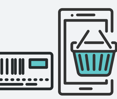
Offering customers single checkout and the benefits of shopping with Boots including Advantage Card points