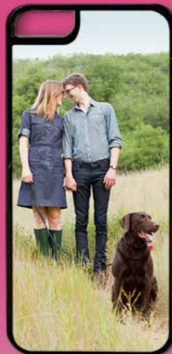
iPhone Photo Case