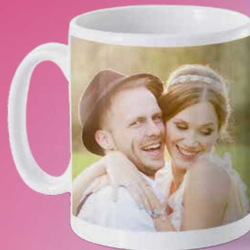
Personalised Photo Mug

And that's not all, if you want to really get personal – you can use your favourite snaps to create a gift for your loved one to treasure.